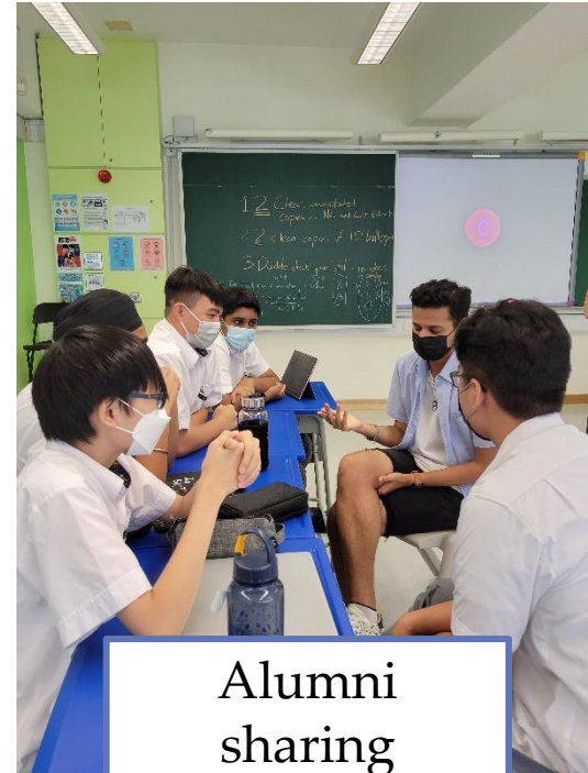
Alumni sharing 舊生分享