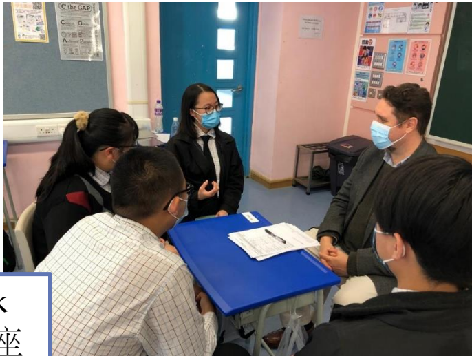
Career Talk 生涯規劃講座